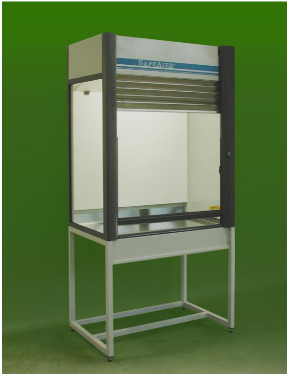
Freestanding S1200 Ducted Fume Cupboard on Base-Stand (Height: 240 cm)

SafeAire™ 'S' range Ducted Fume Cupboards are protective ventilated enclosures providing for the safe and controlled release of toxic contaminants released or generated within them to outside atmosphere – connected to ductwork and extractor system. A horizontal-even-airflow cleanses the work surface inside the fume enclosures, removing all contaminants of both heavier-and lighter-than-air toxic gases, vapours, aerosols and particulates from the environment, in line with European, British and International safety standards.